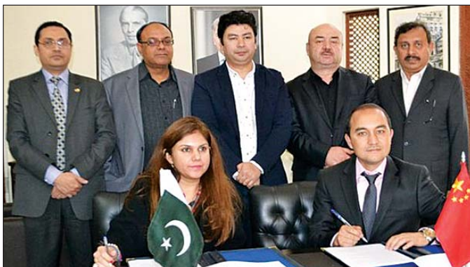
PBIT signs agreement with Tabassum International Trade Co. Ltd, a major manufacturer of home appliances in China, will set up manufacturing plants and branch offices in Punjab province.