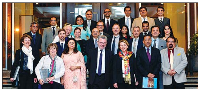
A Group photo with the visiting members of French Senate