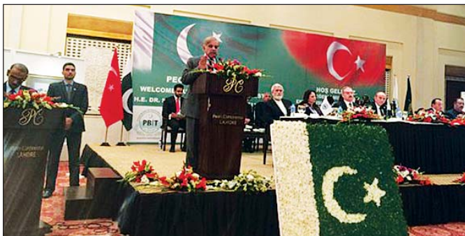
CM Punjab delivering his speech at PBIT's event