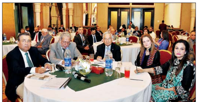
A view of the audience.