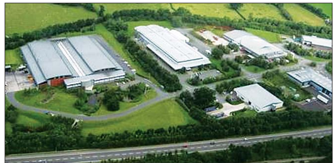
PBIT will facilitate China to build 1,200 acre ecofriendly industrial estate in Punjab