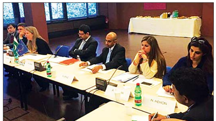
CEO PBIT representing Punjab at the "Seminar on Investment Opportunities in Pakistan" in Rome, Italy.