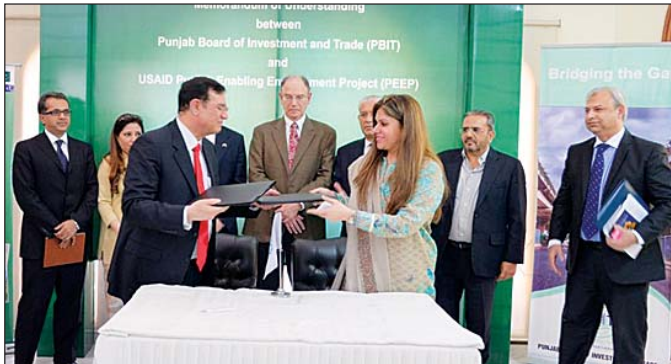
PBIT & USAID PEEP signed MoU to work together towards promoting investments in Punjab