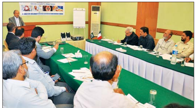
A view of the participants.