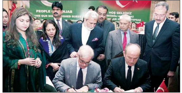
Mayor Kader Topbas of Istanbul and CM Punjab signing a comprehensive agreement between Planning and Development Board and Istanbul Municipality covering local Government, Urban Unit, Waste Management, WASA and TEVTA.